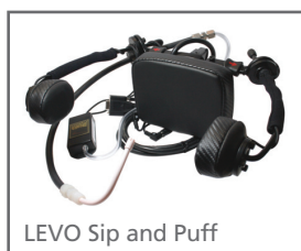
LEVO Sip and Puff