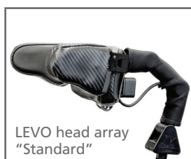
LEVO head array "Standard"

LEVO Sip and Puff: The perfect combination of sip and puff in a head array: sip and puff for the forward/backward movement, proximity sensors for direction.